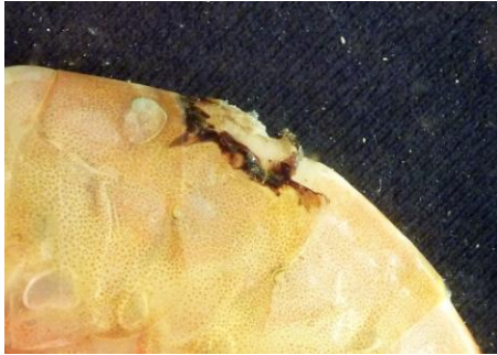
Lesion on shrimp stained by what appears to be oil