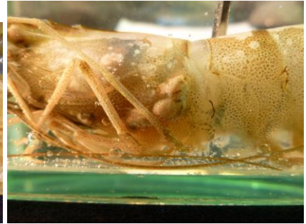
Lesions on Shrimp