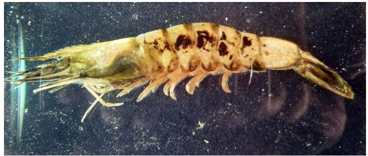
Discolored shrimp with what appears to be oil under shell